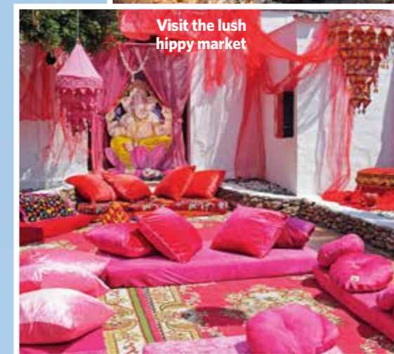
Visit the lush hippy market

A must for any itinerary is a visit to Ibiza Town, among the