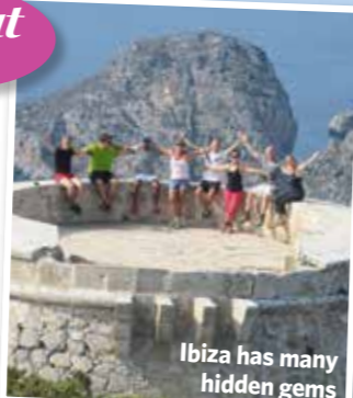
Ibiza has many hidden gems

Pack hiking boots and head off the beaten track on one of Ibiza's walking routes. Book a guide at WalkingIbiza.com (0800 088 5499) and enjoy your own private walk or one of the company's community walks.