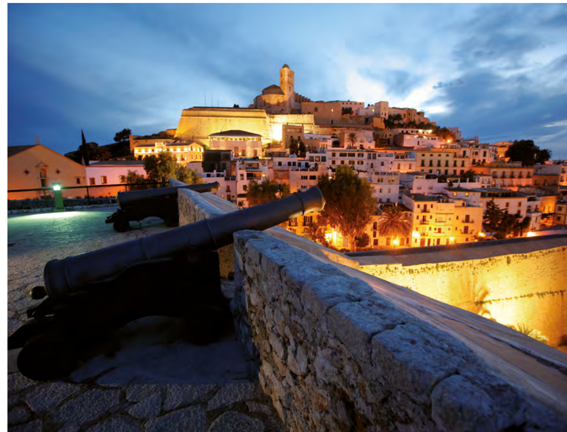
SANTA LLÚCIA BASTION | DALT VILA